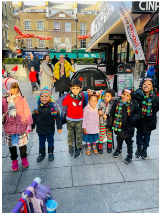
Figure 20 - Children from Belmont Hostel are taken by CARIS Families on a trip to the Children's Story Centre in Stratford