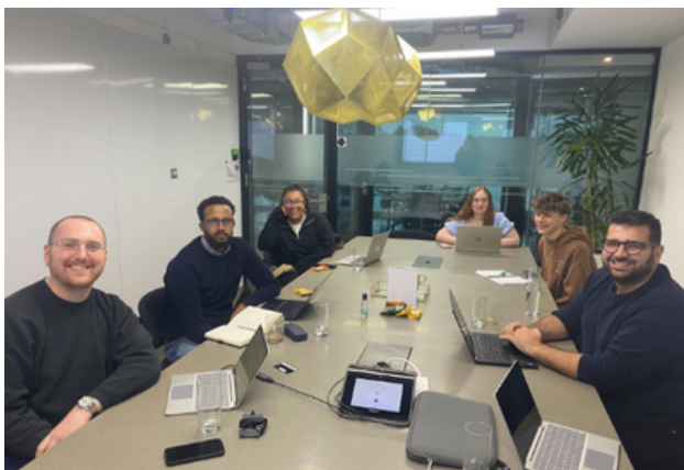
Figure 21 - Brighter Futures Fund grants panel, October 2023