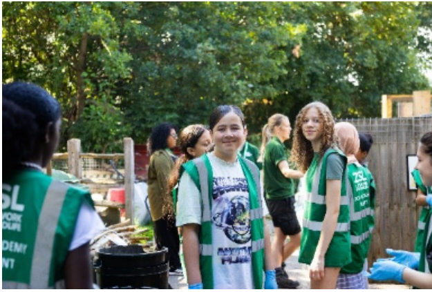
Figure 14 - Children and young people at ZSL London Zoo's Summer 2023 HAF programme