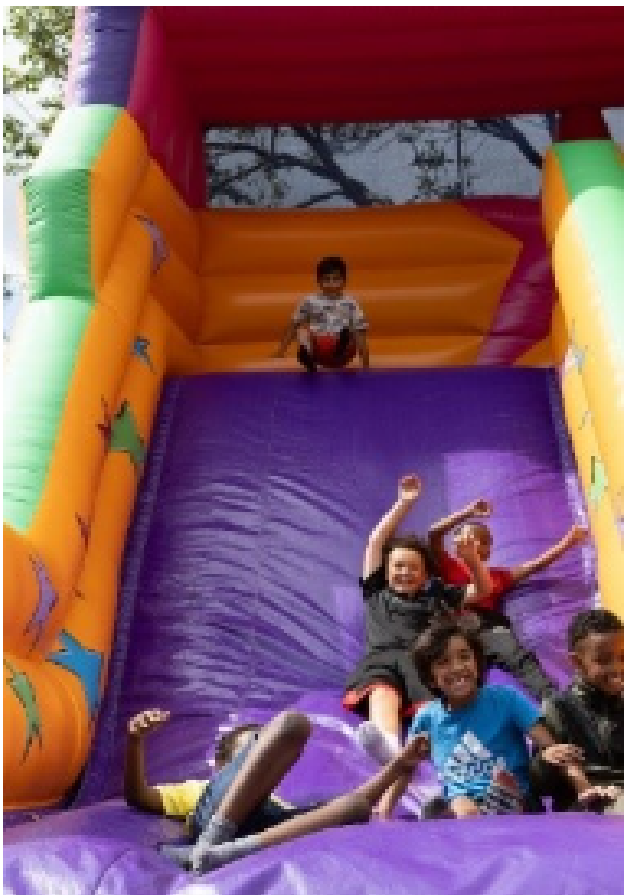
Figure 16 - Torriano Primary School HAF Programme, Summer 2023