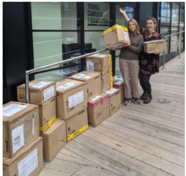
Figure 17 & 18 - YCF office filled with donated toys, and YCF team photographed with boxes