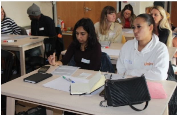
Figure 10 - YCF members at our LGBTQ+ youth awareness training, June 2023