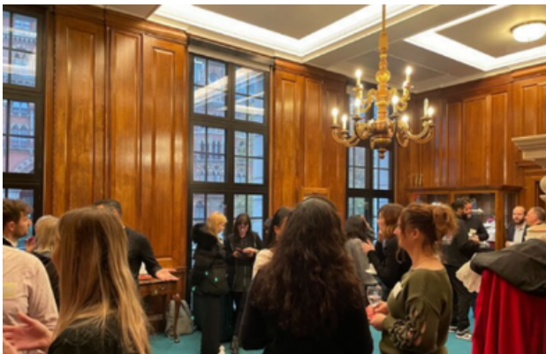
Figure 11 - A YCF business breakfast at Camden Town Hall for corporate neighbours interested in supporting Camden's children and young people

This year we saw the launch of our Business Partnership Programme, which counts 13 in number, with a network newsletter and ample opportunities for our corporate neighbours to get engaged with the work of our member organisations, to help support Camden's children and young people.