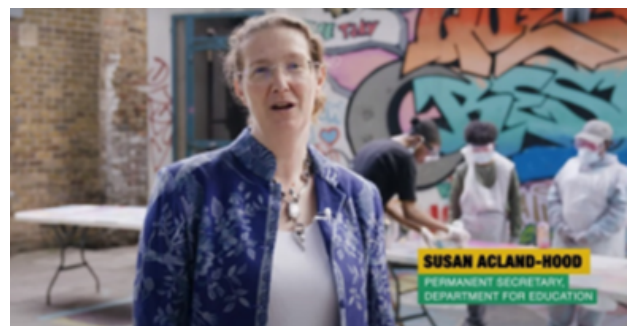
Figure 13 - Susan Acland-Hood, Permanent Secretary of the Department for Education, featured in YCF's Summer HAF video

We were also especially proud this year that a YCF member organisation and HAF provider in Camden, HvH Arts secured a national Department for Education award for exceptional delivery. We were also very proud that Camden's HAF programme secured an additional £100,000 of funding from Camden Council's Family Crisis Fund, in recognition of growing need amongst Free School Meal eligible children and young people's families, as a result of the cost-of-living crisis.