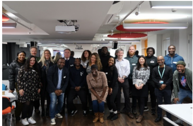
Figure 9 - YCF members are our first Level Up Youth Work network event this year