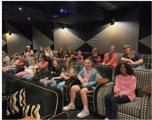
Figure 19 - 40 young girls from 7th St Pancras Girl Guides attend a private, neurodivergent-friendly screening of the film Barbie