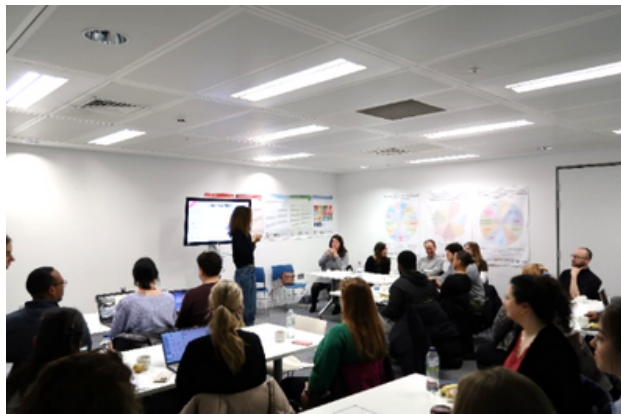
Figure 8 - Packed press and communications workshop for YCF members, March 2023