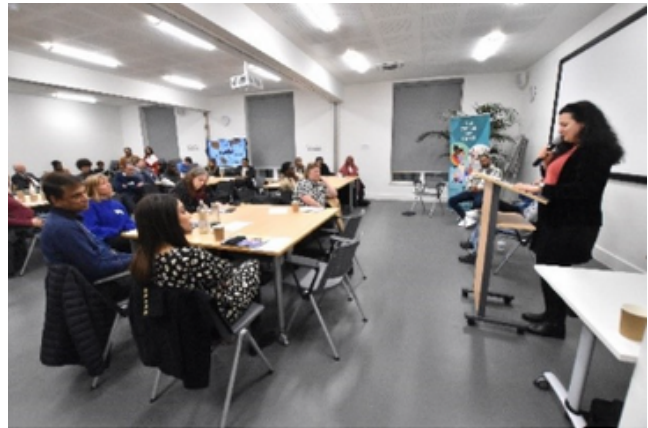
Figure 3 - Building Equal Foundations event, organised by the Equalities team at Camden Council, at the Greenwood Centre, February 2023

We were also so proud to be chosen to be the incoming Mayor of Camden's Charity of the Year, in May, for the 2023/24 year of Mayor Councillor Nazma Rahman.