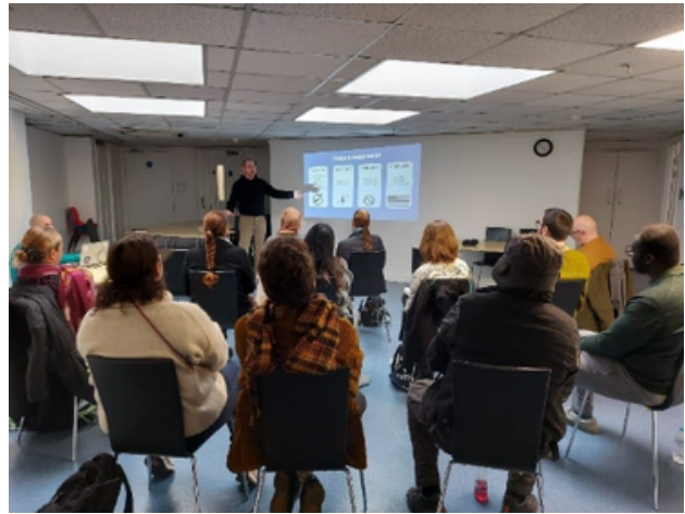
Figure 7 - YCF and Camden Giving grant writing masterclass for members, November 2023