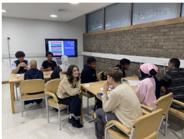
Figure 4 - The first meeting of YCF's Young Ambassadors programme, at Swiss Cottage Library, September 2023

As of December 2023, YCF has 186 members, and a significant part of our work is engaging our members. In 2023, our events for members have included specialist trainings, including a media and communications workshop (with local experts including the Camden New Journal in attendance), Autism Spectrum and SEND awareness training for youth and play workers (with local experts Asperger London Area Group), our Black History Month celebration (featuring an expert panel discussing black leadership in Camden's youth sector), and our first leadership