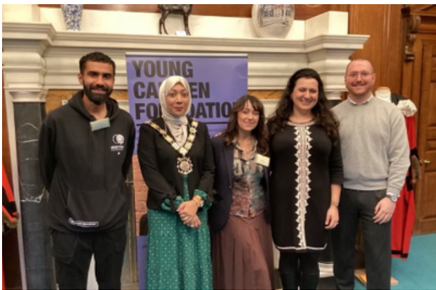
Figure 2 - YCF team with the 23/24 Mayor of Camden, and YCF members HvH Arts and Camden United FC

This year, our team has continued to work closely with Camden Council, to represent the children and youth sector every step of the way. This has included working with Camden's Integrated Youth Team to ensure the voluntary sector continues to be supported, representing YCF and members at community events to ensure the voices and experiences of young people during the cost of living crisis are not forgotten, and co-organising the National Youth Work Week at Camden Town Hall, to continue to give voice to voluntary sector youth interventions.