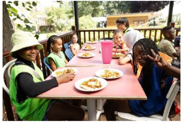
Figure 15 - Children enjoying their lunch at Calthorpe Community Garden's HAF programme this Summer 2023